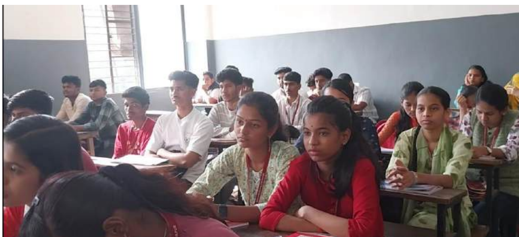
Figure 7: The students of B. A. Part- I gave tremendous response to this workshop and listened all the speakers very attentively.