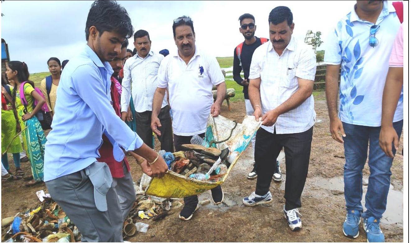
Figure 2: Volunteers, teachers and non-teaching staff all come together to clean up the Masai Plateau