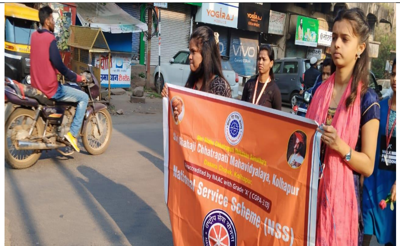
Figure 2: Volunteers walked silently and peacefully during rally रॅली दरम्यान स्वयंसेवक मूकपणे आणि शांततेने चालत होते