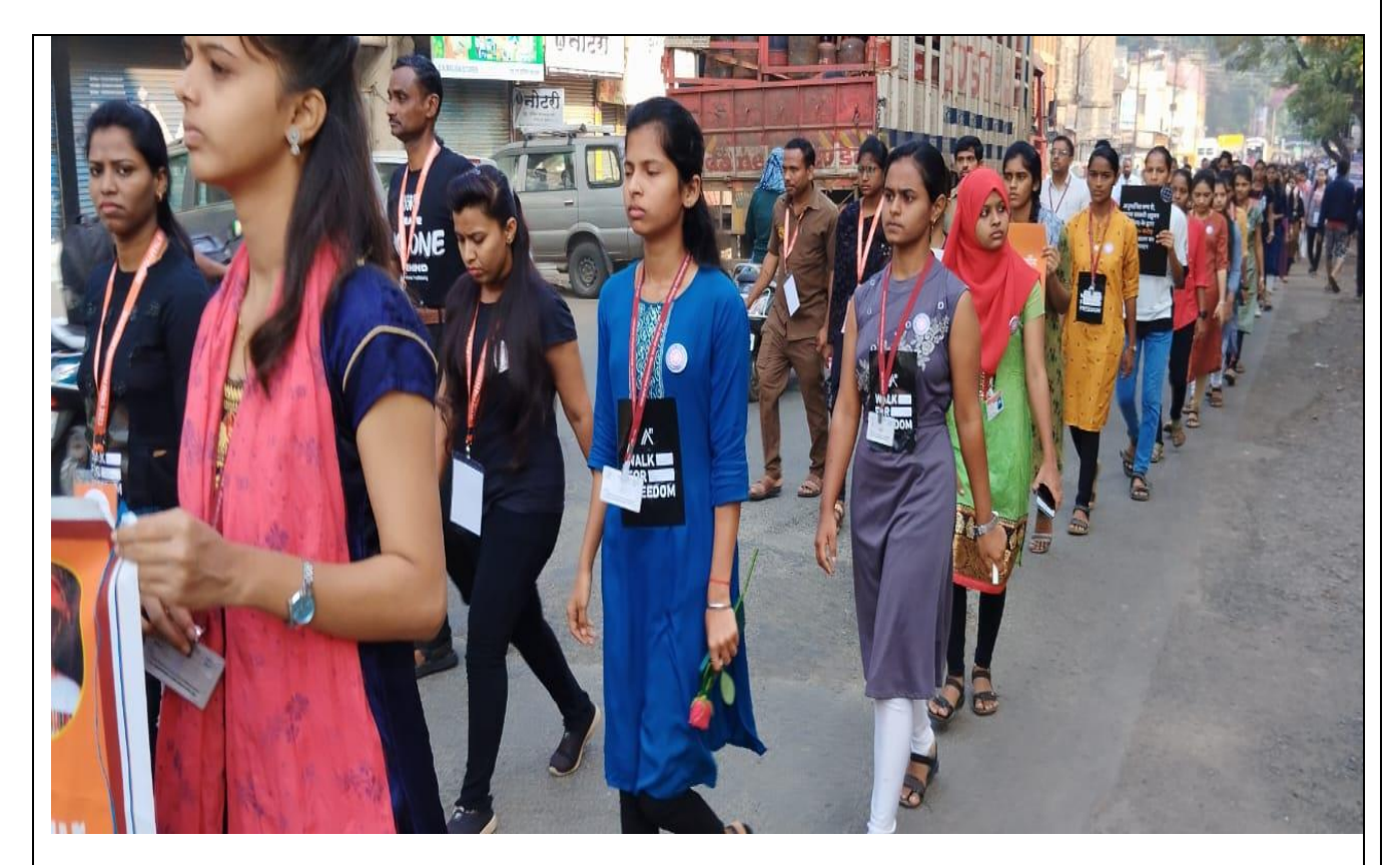
Figure 3: Volunteers walked silently and peacefully during rally रॅली दरम्यान स्वयंसेवक मूकपणे आणि शांततेने चालत होते