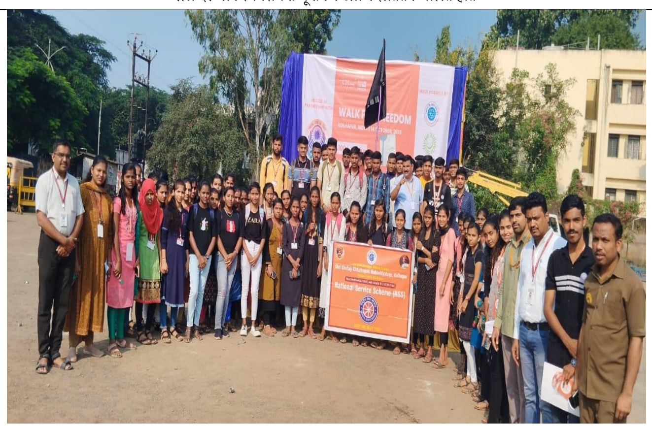
Figure 4: Moments of rally conclusion रॅली समारोपाची क्षणचित्रे