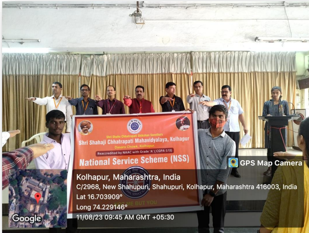
Figure 1 : Dignitaries taking Panchpran Oath पंचप्रण शपथ घेताना मान्यवर