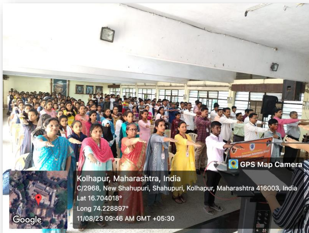
Figure 2: Teachers and students taking Panchpran Oath पंचप्रण शपथ घेताना शिक्षक व विद्यार्थी