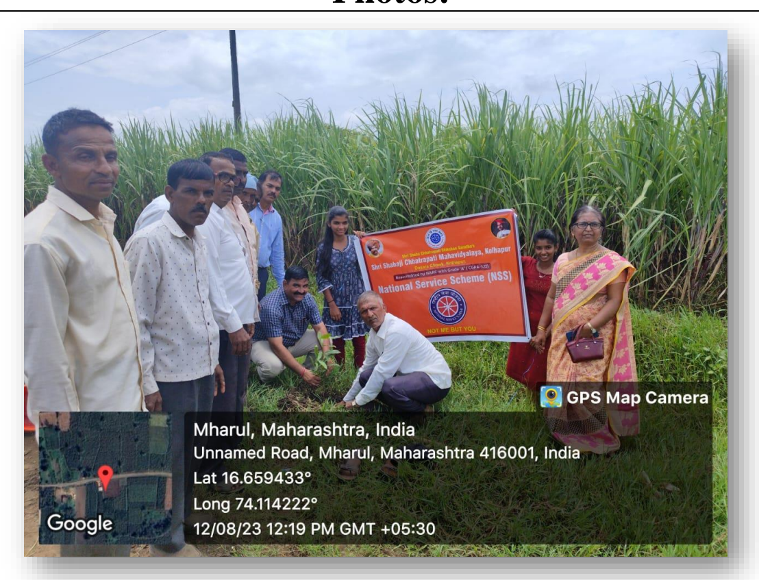
Figure 1 : Villagers, Professors & volunteers during tree plantation in Bahireshwar village.

बहिरेश्वर गावात वृक्षारोपण करताना ग्रामस्थ, प्राध्यापक आणि स्वयंसेवक