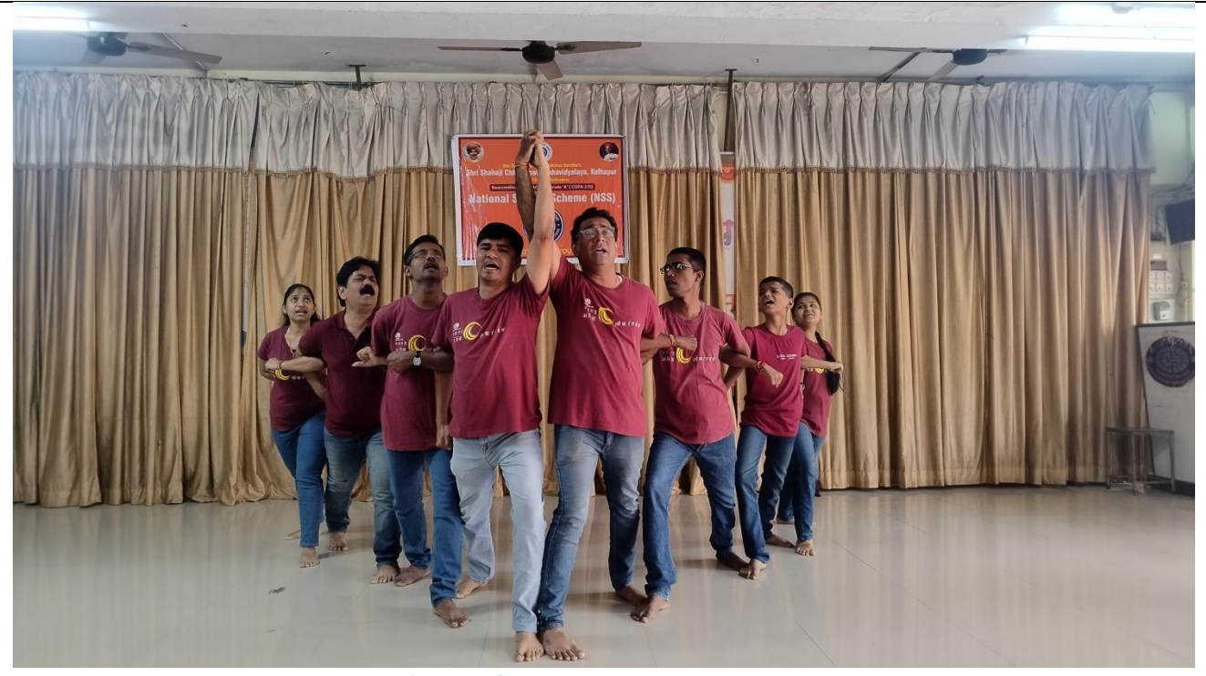
Figure 2: Members of 'ANS' performing the Ringan Natak रिगण नाटकाचे सादरीकरण करताना 'अंनिस' चे सदस्य