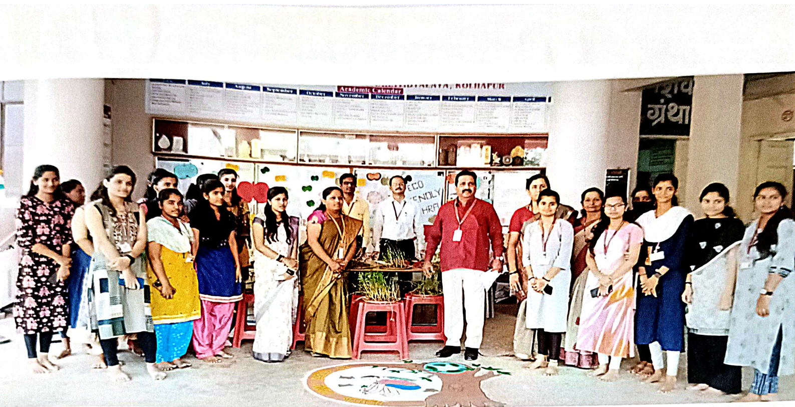
Eco - Friend 1-1 Dassaag