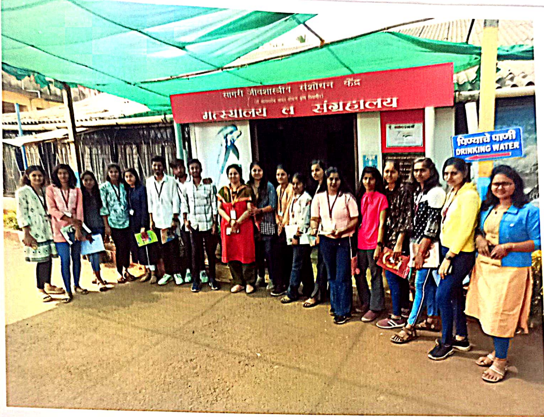
B. Sc. II Study tour : Visit to Ratnagiri Fish Museum