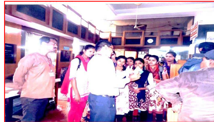
The Kolhapur Urban Co.- Op. Bank ltd, Kolhapur.