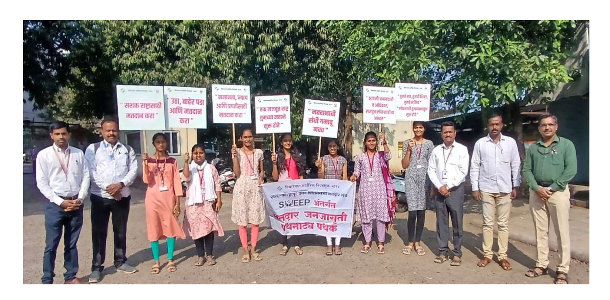
Participated in Voter Awareness rally

Affiliated to - Shivaji University, Kolhapur-416 004, Maharashtra E\text{-}mail:sscm34.cl@unishivaji.ac.in / shahaji\_college\_kop@yahoo.com Phone: (O) (0231) 2644204, (M) 9960995853