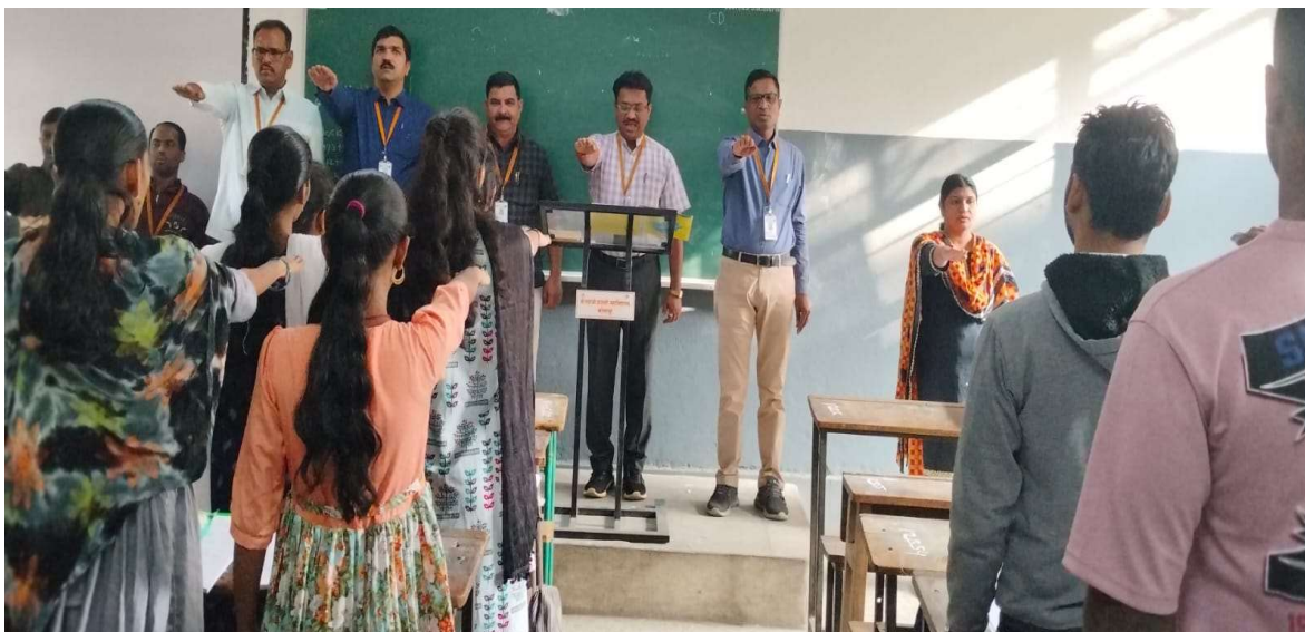
Celebration of Indian Constition Day

Phone : (O) (0231) 2644204, (M) 9960995853