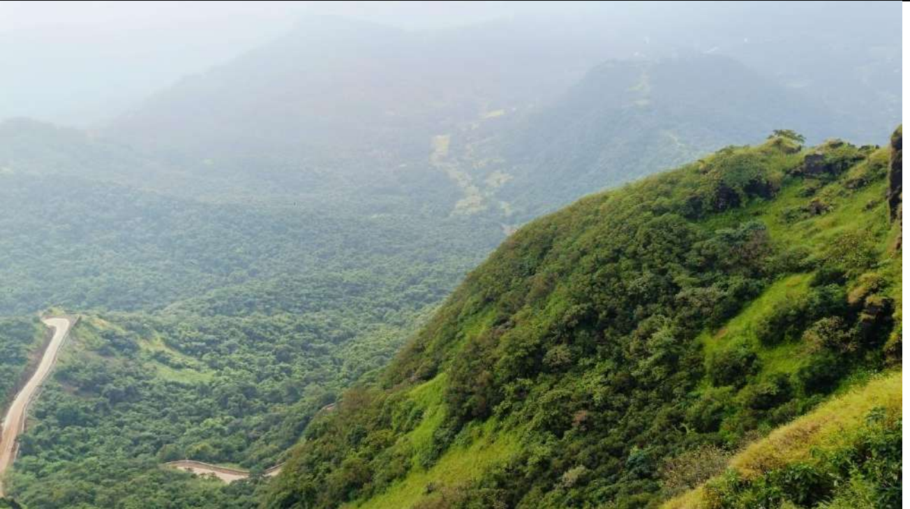
Figure 2: A panoramic view of the Sahyadri mountain range from Gagangiri fort.....

गगनगिरी मठ व गडास अभ्यास सहलीनिमित्त भेट देताना भूगोल विभागाचे सहभागी विद्यार्थी आणि शिक्षक