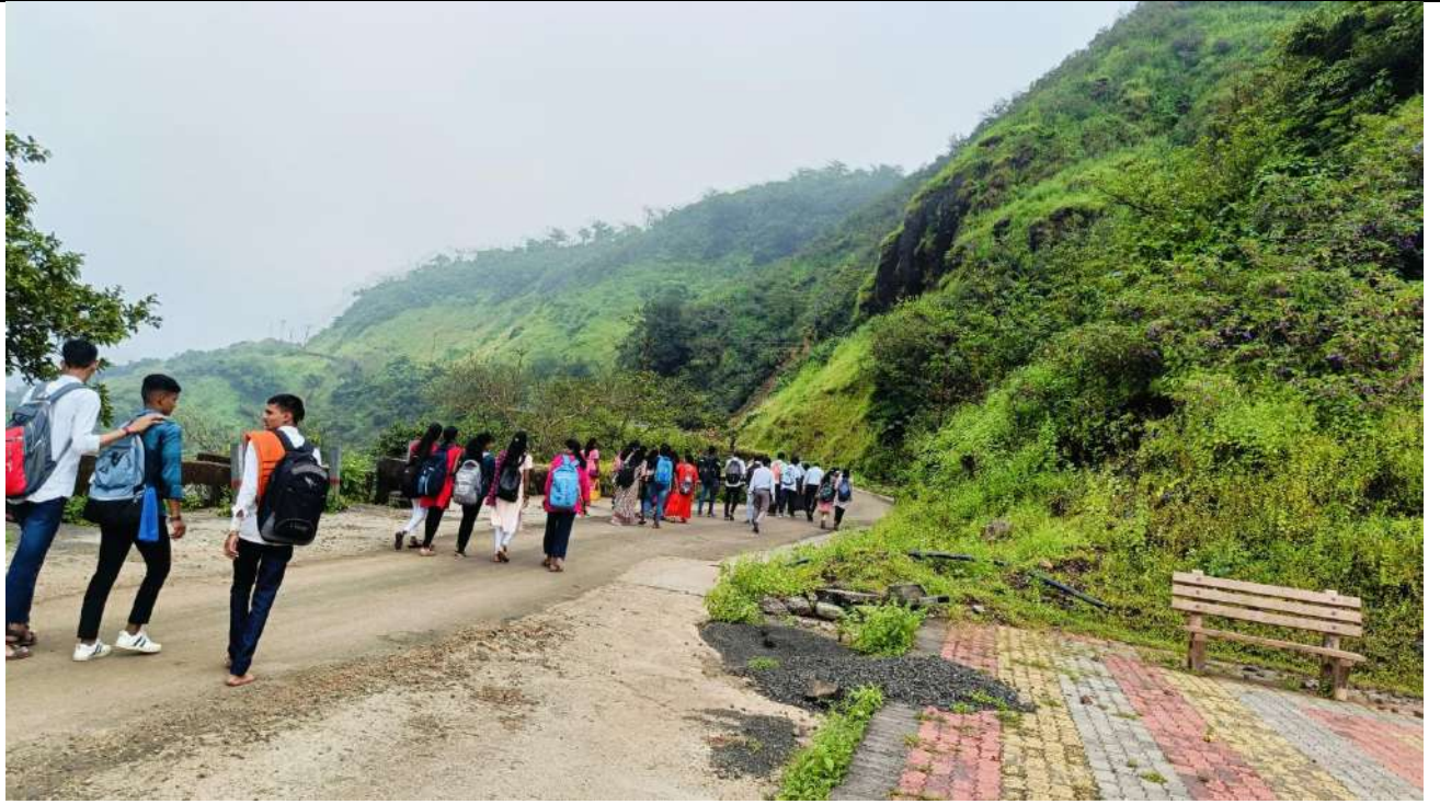
Figure 9: Students trekking in Gagangiri area गगनगिरी परिसरात ट्रेकिंग करताना विद्यार्थी