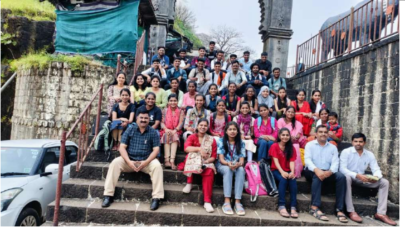
Figure 1 : Students and teachers of the Geography Department visiting Gagangiri Math and fort for study purposes

गगनगिरी मठ व गडास अभ्यास सहलीनिमित्त भेट देताना भूगोल विभागाचे सहभागी विद्यार्थी आणि शिक्षक