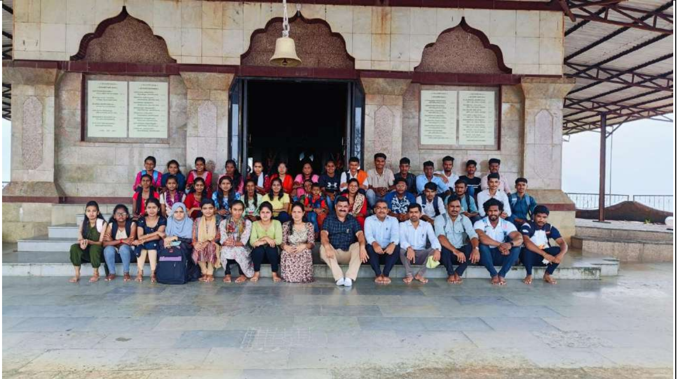
Figure 4: Dhyana Temple Premises at Gagangiri Fort गगनगिरी गडावरील ध्यान मंदिर परिसर