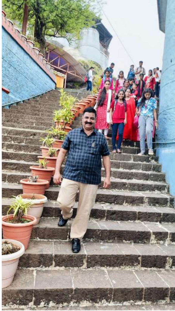
Figure 7: Students and teachers of the Geography Department while trek the Gagangiri area

भूगोल विभागाचे विद्यार्थी आणि शिक्षक गगनगिरी परिसरात ट्रेक करताना