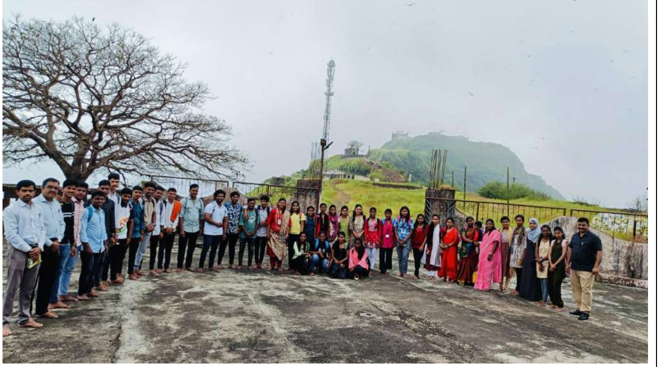
Figure 5: Students and teachers of Geography Department visited the high places of Gagangiri Math to see the mountain range

भूगोल विभागातील विद्यार्थी आणि शिक्षकांनी पर्वतरांग पाहण्यासाठी गगनगिरी मठाच्या उंच ठिकाणांना भेट दिली