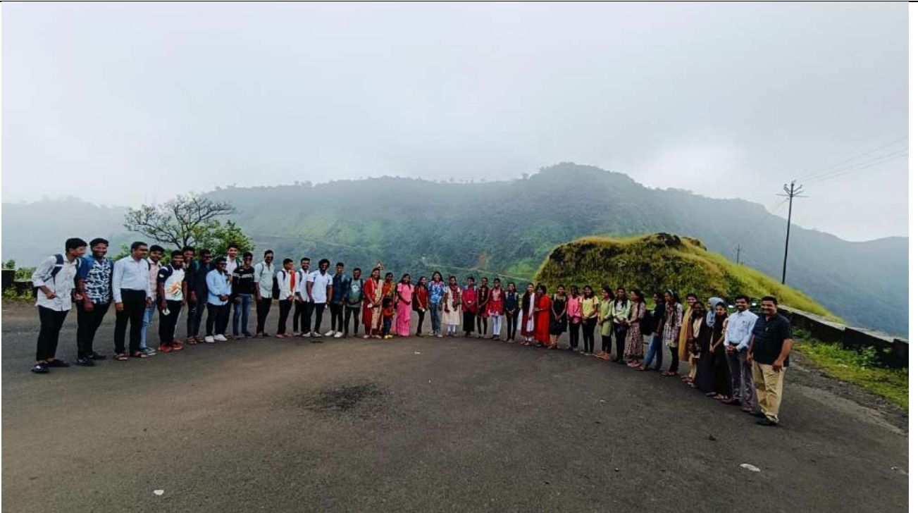
Figure 10: Group photo during trekking ट्रेकिंग दरम्यानचा ग्रुप फोटो