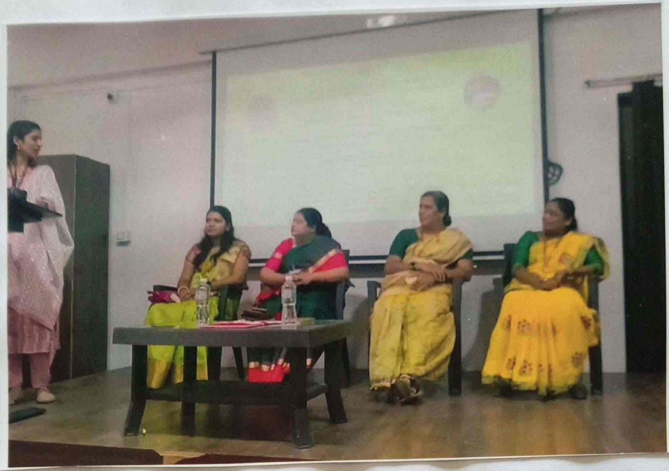
© Guest lecture on "polycystic Ovary Syndrome" (PCOS)