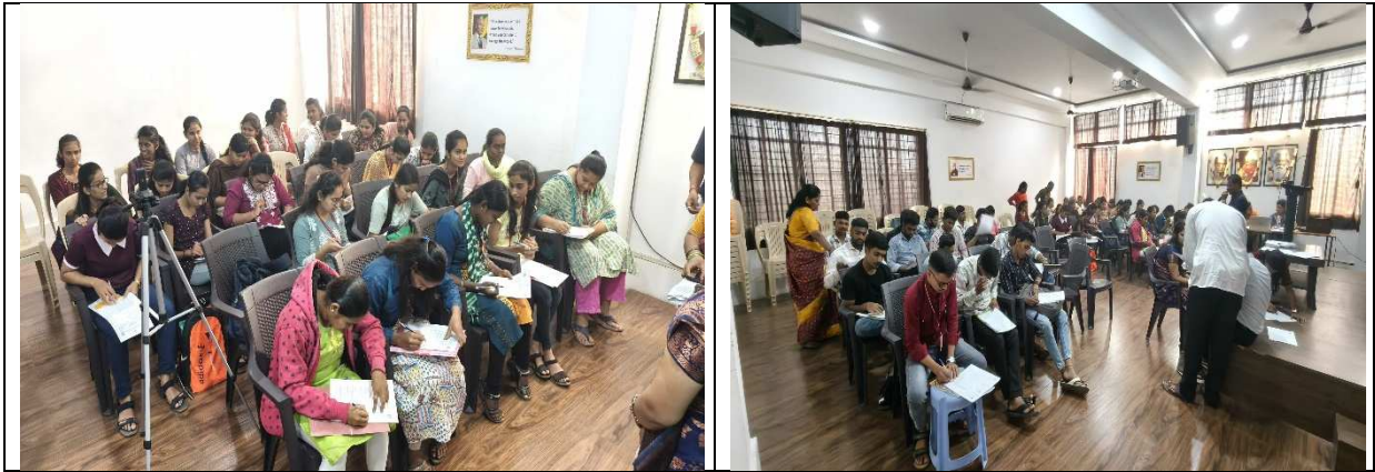
The first round of quiz competition which was written test.

The second round was the buzzer round. This round contained three sub-rounds. In the first sub round they asked 10 questions on 'Indian constitution' and in the second sub round they asked 10 questions on 'Indian Democracy'. After the completion of these two rounds, they eliminated 2 groups and selected 4 groups for the final round.