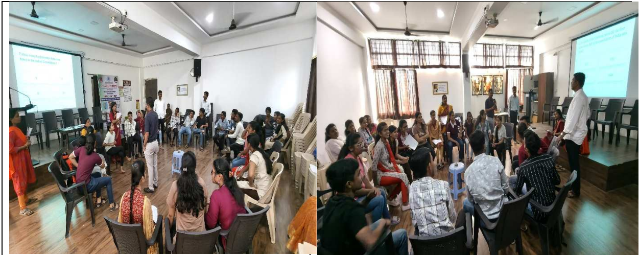
The final quiz round which was buzzer round.

The second round was the buzzer round. This round contained three sub-rounds. In the first sub round they asked 10 questions on 'Indian constitution' and in the second sub round they asked 10 questions on 'Indian Democracy'. After the completion of these two rounds, they eliminated 2 groups and selected 4 groups for the final round.