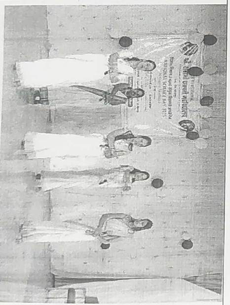
Activities performed by students