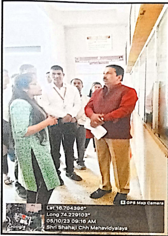
Our participated student while explaining her thoughts on her prepared poster relevant to suicide