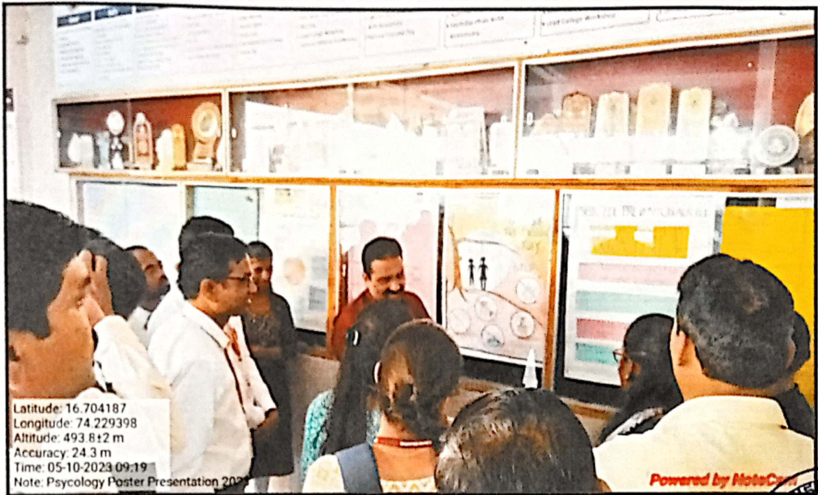
Our participated student while explaining her thoughts on her prepared poster relevant to suicide