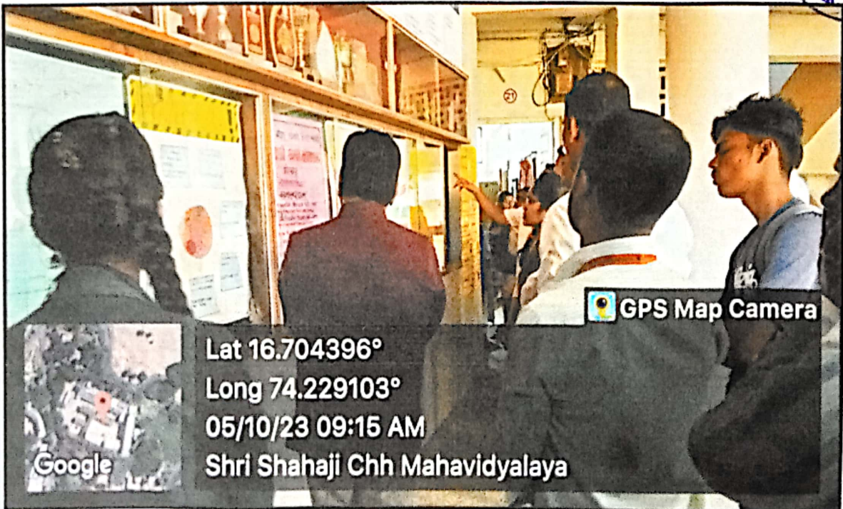
Our participated student while explaining her thoughts on her prepared poster relevant to suicide