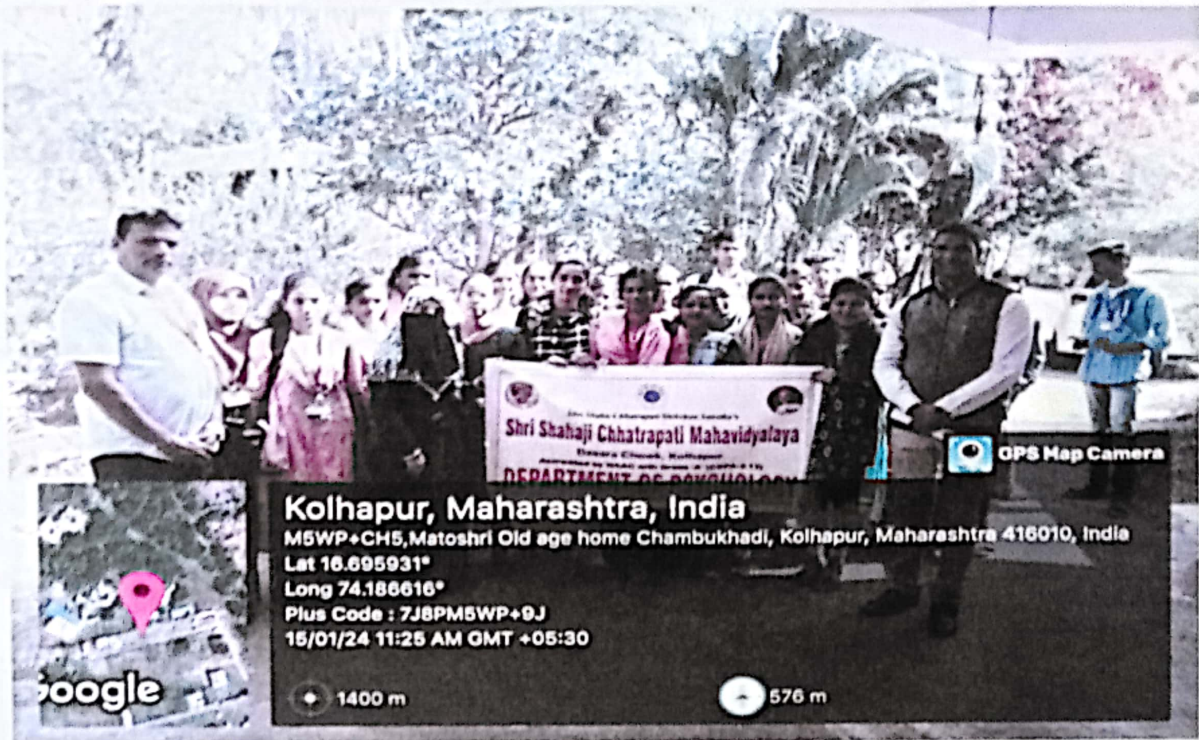
Participated students in study visit at Matoshri Old Age Home, Chambukhadi, Shinganapur, Kolhapur