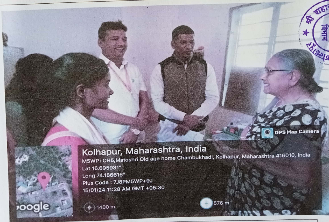
Students while engaging & Distribution of Tilgul & discussing with older female