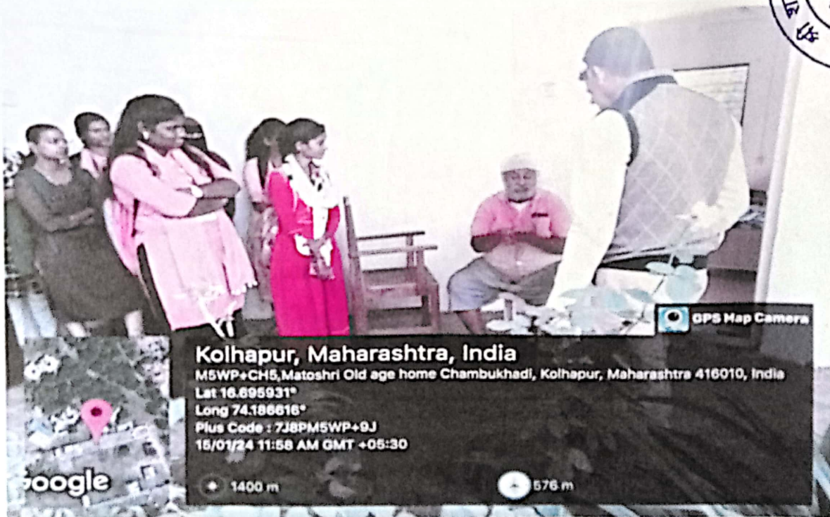
Our students while engaging in discussion with older people