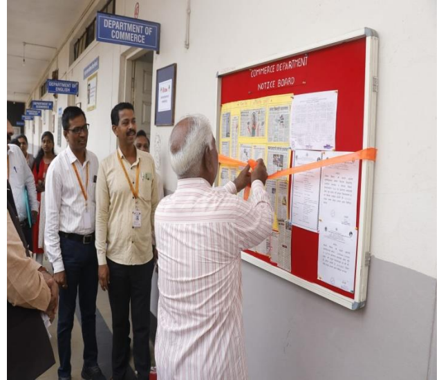
Inaguration of Notice Board