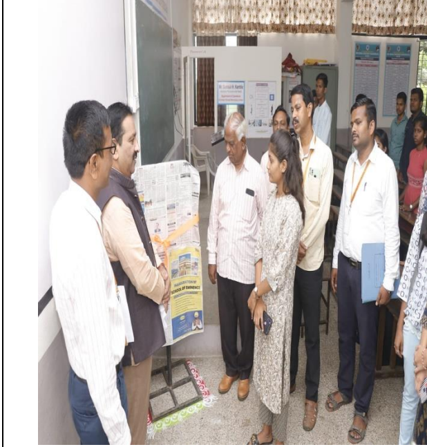
Commerce Forum Inaguration 2023-24