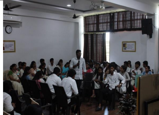
Students Presentations in Deabte Competition