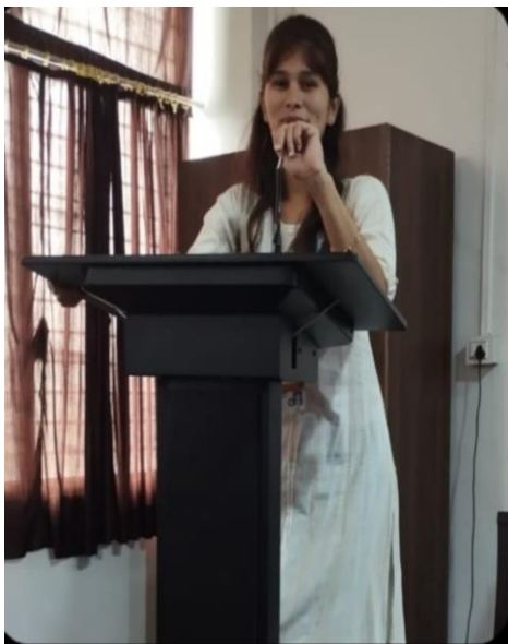
Students presentation in One Minute Extempore