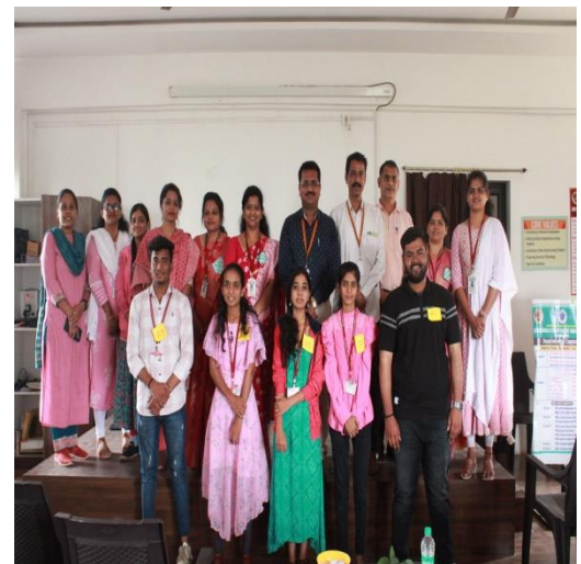
Group photos of contestants of the competition