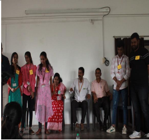
One minute extempore competition contestants