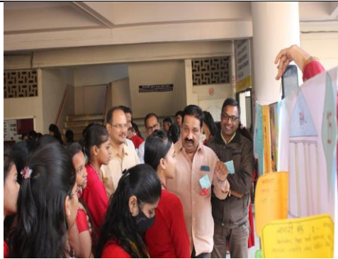
Poster presentation by Students