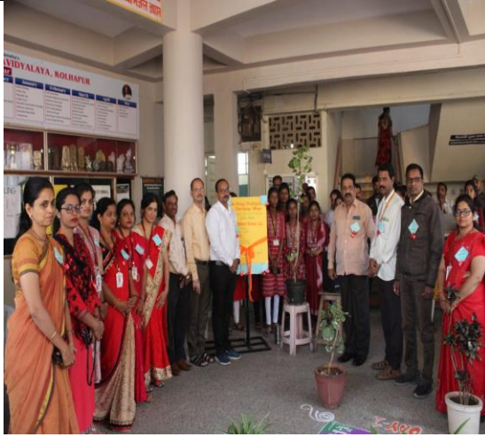
Poster Presentation Inauguration