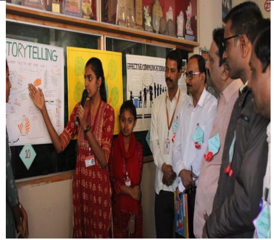
Poster presentation by Students