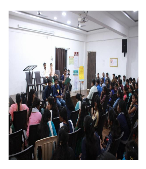
Glimps of Quiz competition