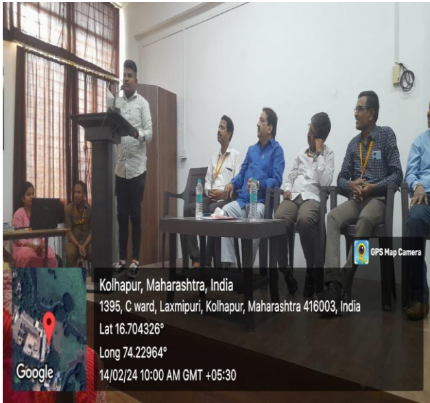
Students opinions about commerce Festival 2024