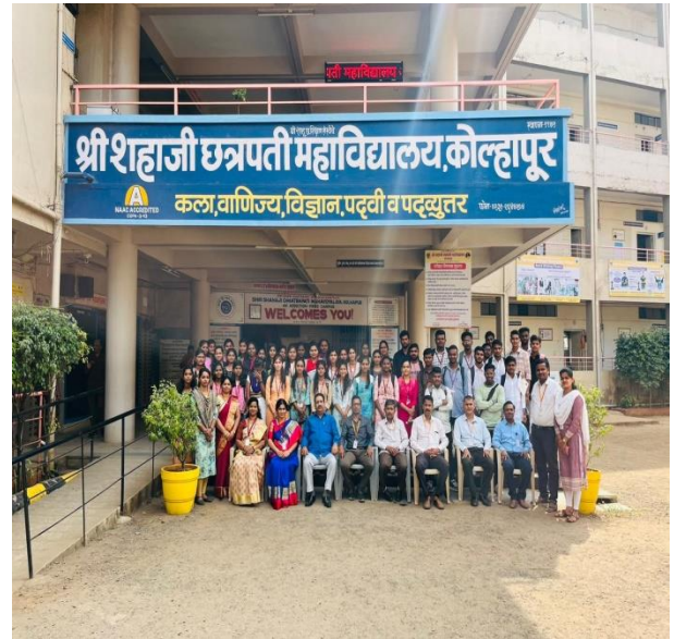
Group Photo of Prize Winner Students and Principal, HoD, other Teachers, Registrar and NAAC coordinator