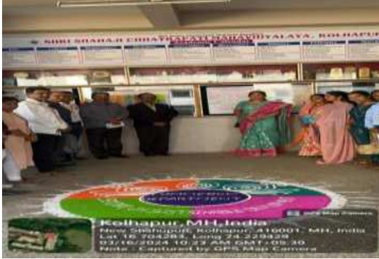
Inaguration of Poster Presentation on “ Sustainable Development in India”