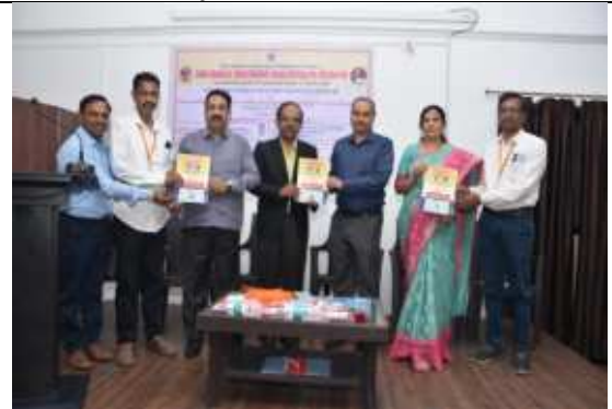
Publictation of Special issue of Vidyawarta International Journal on “Sustainable Development in India: Strategies and Emerging Trends in Businesses”