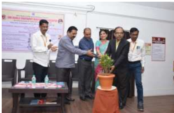
Inaguration of Seminar by the Auspicious Hands of the Dignitaries