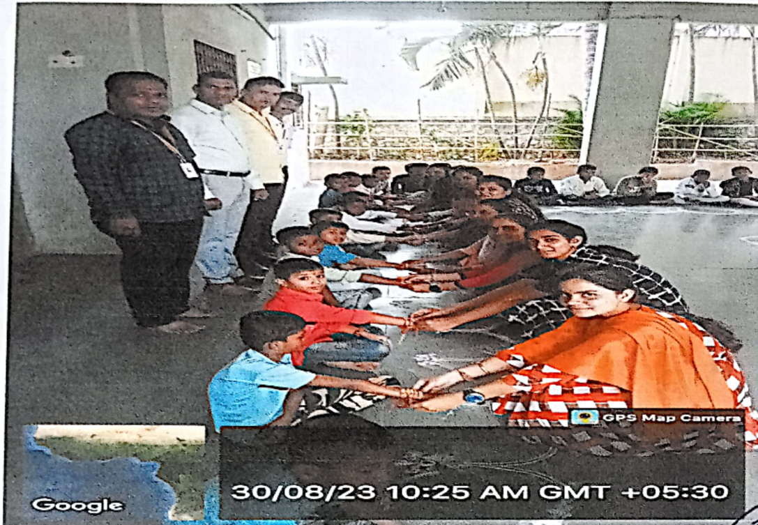
Our girl students while tying Rakhi to Children