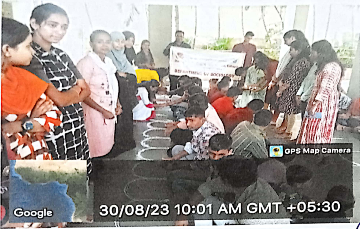
Our Students while tying Rakhi and waving to Children