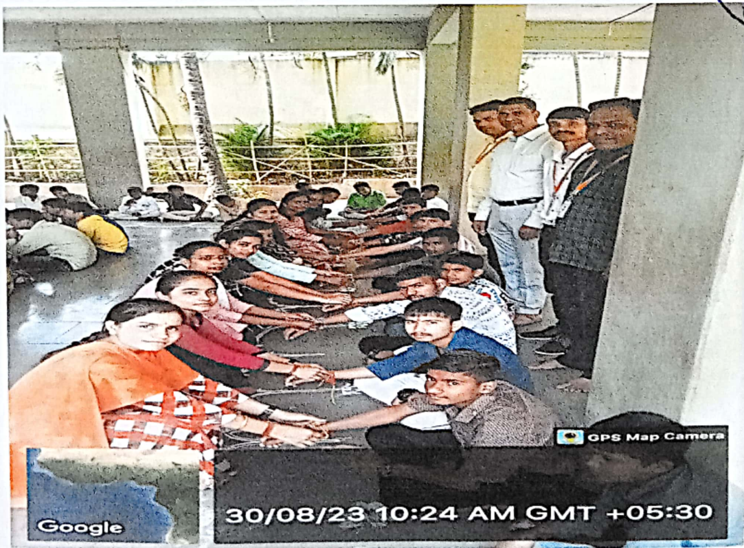
Our girl students while tying Rakhi to Children