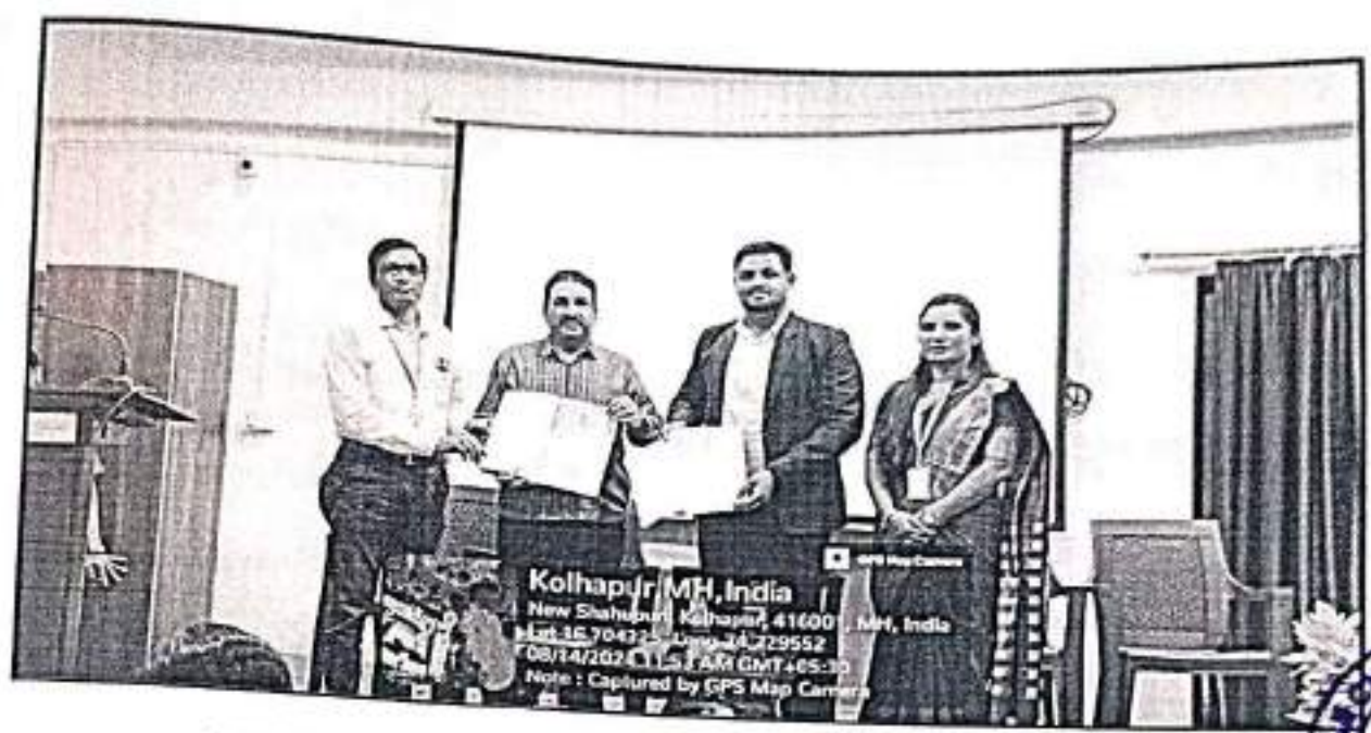
MOU between Kanchan Software Solutions and BCA Department