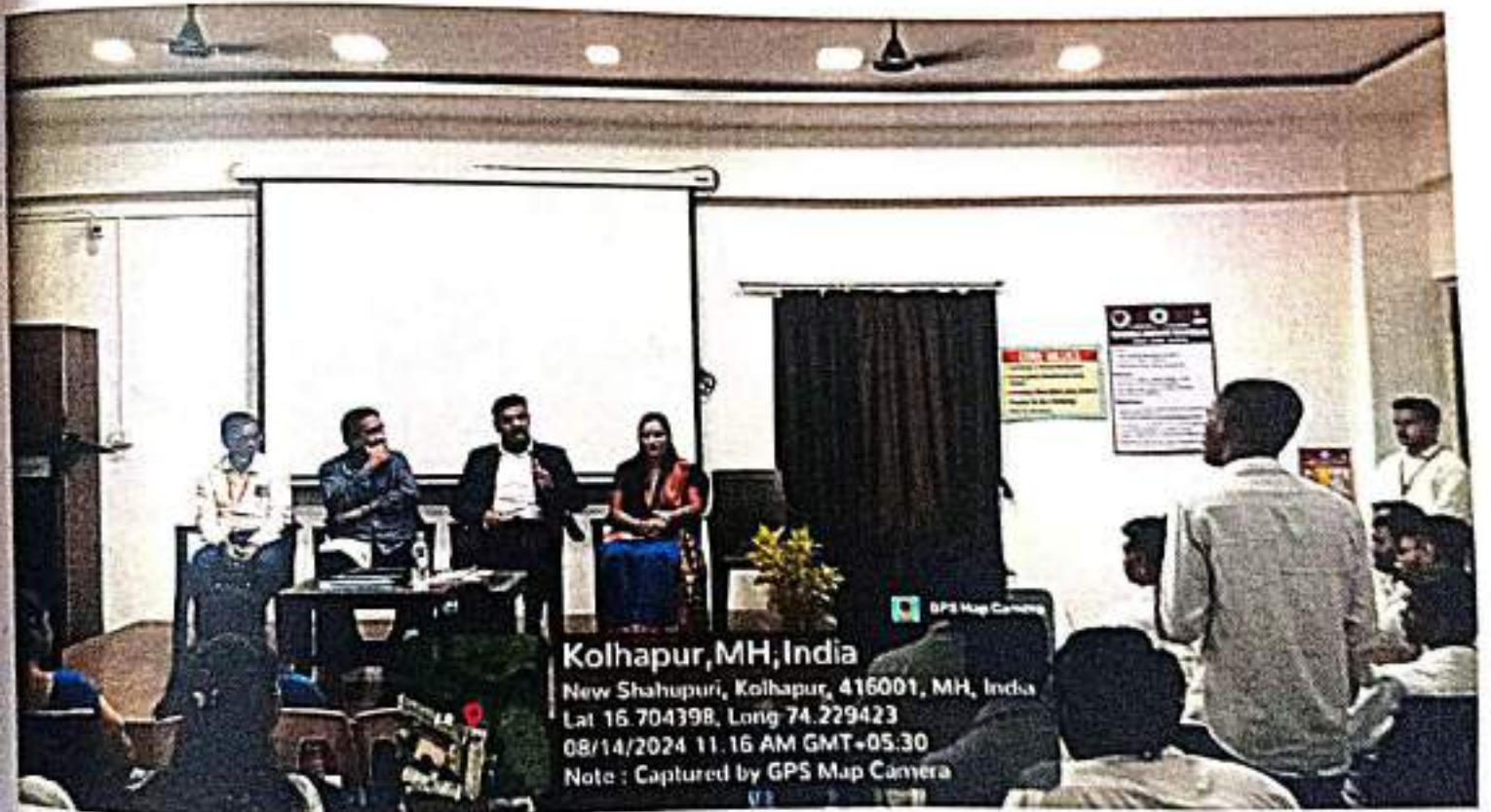
Query asking session