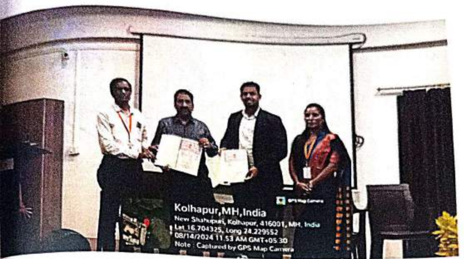
MOU between Kanchan Software Solutions Ltd. & BCA department of Shri Shahaji Chhatrapati Mahavi'dayaya Kop.