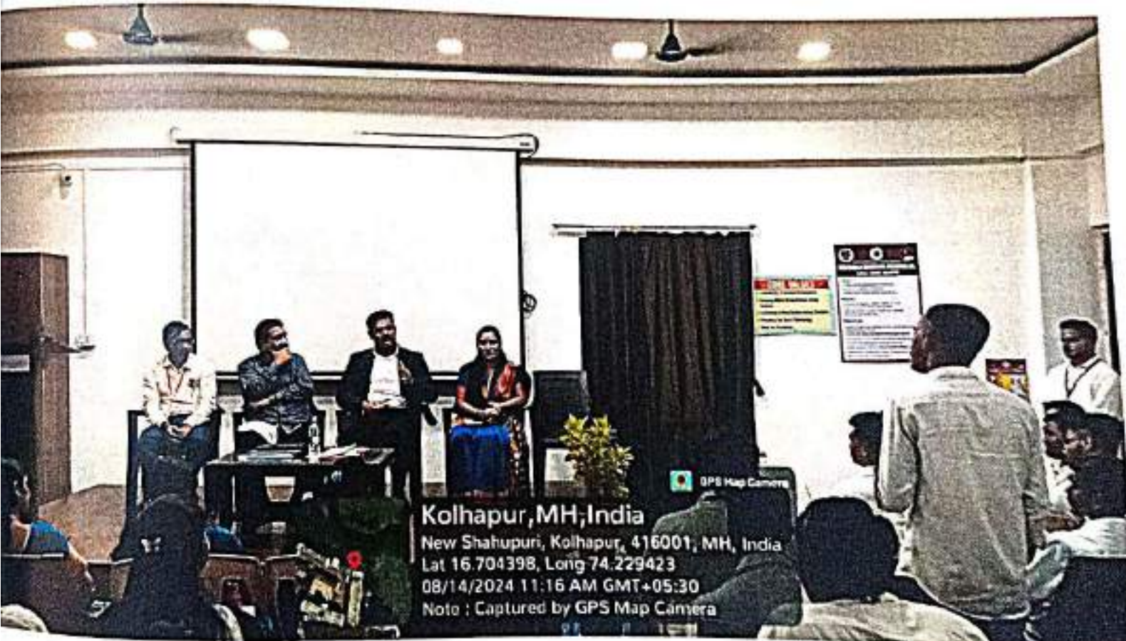
MOU between Kamchan Software solutions Ltd. & BCA department of Shri Shahaji Chharsapati Mahavidyalaya, Kop.

Kolhapur, MH, India New Shahupuri, Kolhapur, 416001, MH, India Lat 16.704398, Long 74.229423 08/14/2024 11:16 AM GMT+05:30 Note : Captured by GPS Map Camera