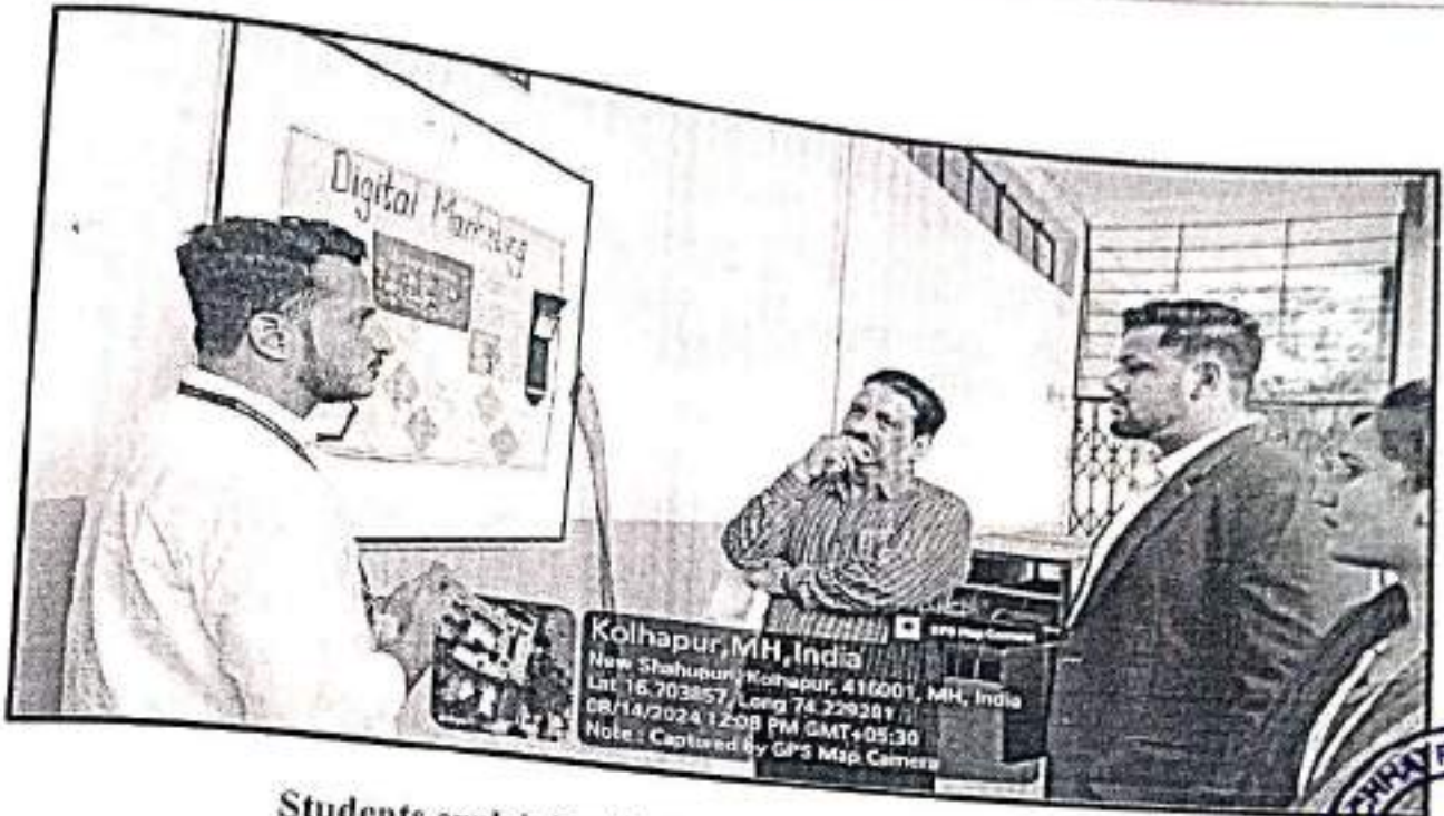
Students explaining the Digital Marketing Poster

E-mail - stcm34.cit@unishivaji.ac.in Phone : (02) (0231) 2544204, (M) 9960995851