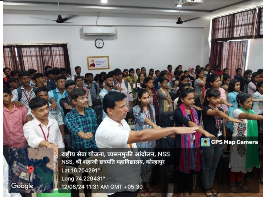
Figure 2: Participated professors and students taking pledge of ' Nashamukti ' 'नशामुक्ती'ची शपथ घेताना सहभागी प्राध्यापक व विद्यार्थी

SEAL AND SIGNATURE OF THE PROGRAM OFFICER: