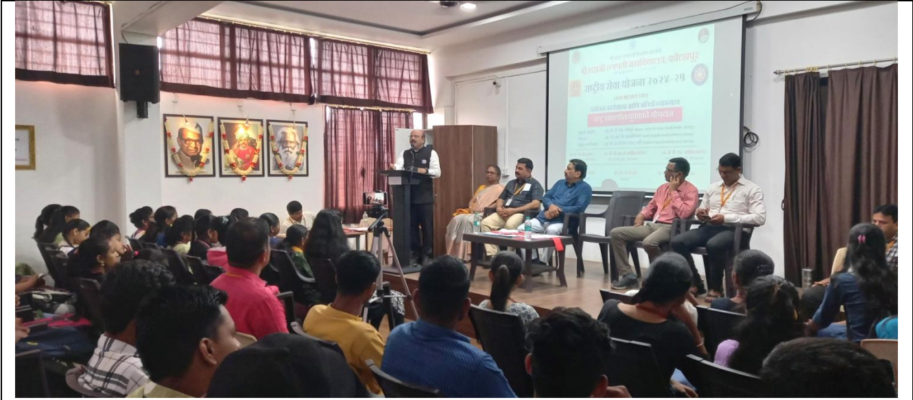
Figure 3 : Chief Guest addressing volunteers present at the event कार्यक्रमाला उपस्थित स्वयंसेवकांना संबोधित करताना प्रमुख पाहुणे