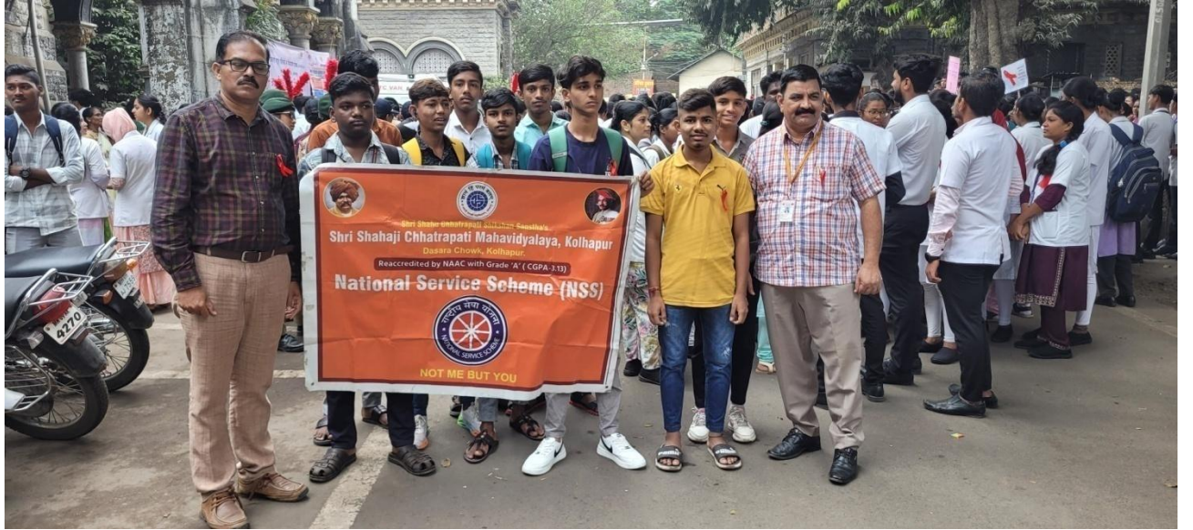
Figure 1 : NSS Program Officers and volunteers and students participated in public awareness morning rally

एड्स विरोधी जनजागृती प्रभातफेरी मध्ये सहभागी झालेले एनएसएस कार्यक्रम अधिकारी आणि स्वयंसेवक व विद्यार्थी