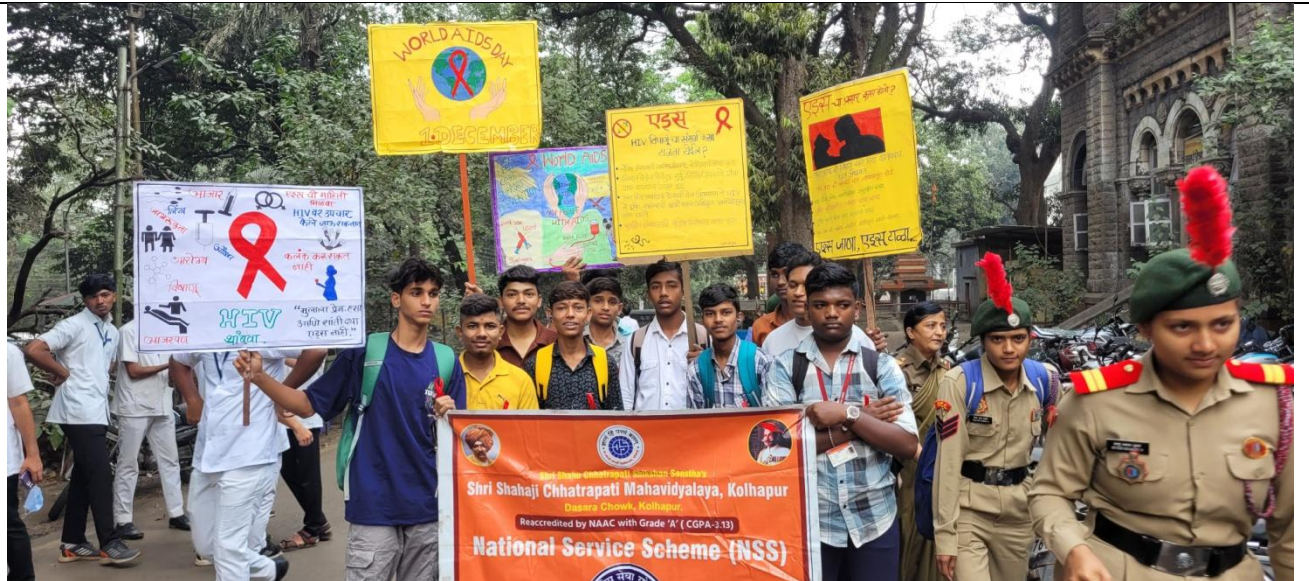
Figure 2: Volunteers & students enthusiastically participated in the anti-AIDS public awareness morning rally

एड्स विरोधी जनजागृती प्रभातफेरी मध्ये सहभागी झालेले एनएसएस कार्यक्रम अधिकारी आणि स्वयंसेवक व विद्यार्थी