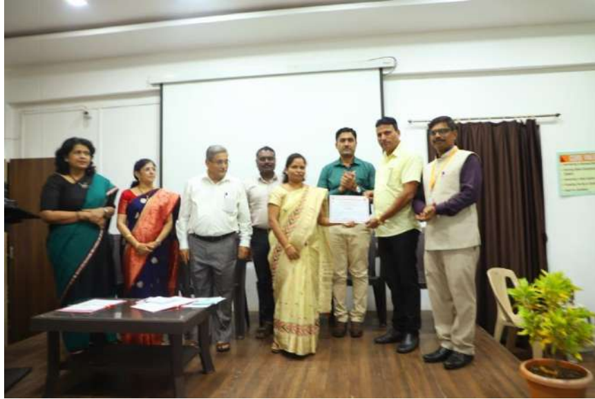
Figure 19: The Dignitaries of the Valedictory Function awarding the Certificate of participation.

Phone: (O) (0231) 2644204, (M) 9960995853