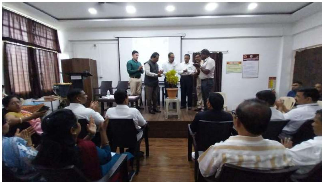
Figure 2: Inauguration of the Workshop with watering the plant at the auspicious hands of Keynote Speaker Dr. Prabhanjan Mane