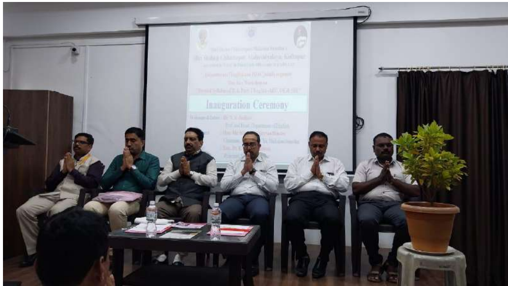
Figure 1: Dignitaries and the Participants while saying the Prayer of the Institution "Dnyam hi Paramam Balam"