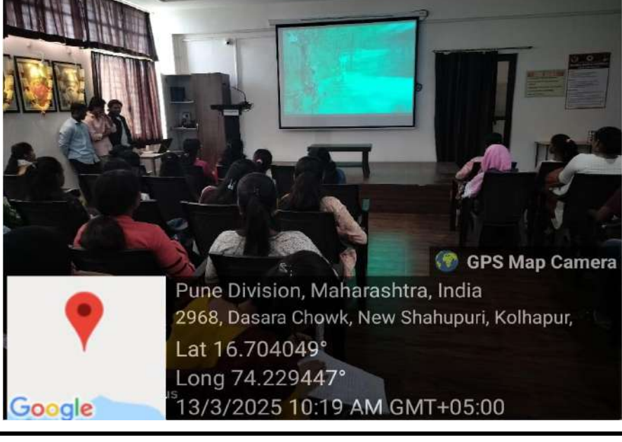
Figure 2: Tremendous response from the students for the Movie Screening Programme