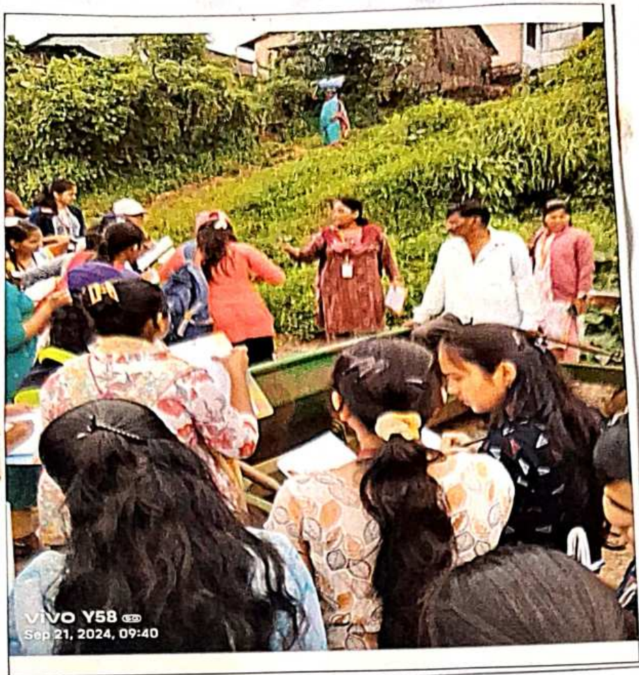
Study tour at Kirve