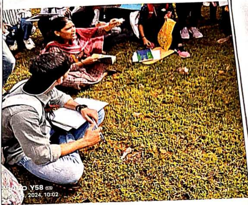
↑ Student observe plant species in study tour. ↓