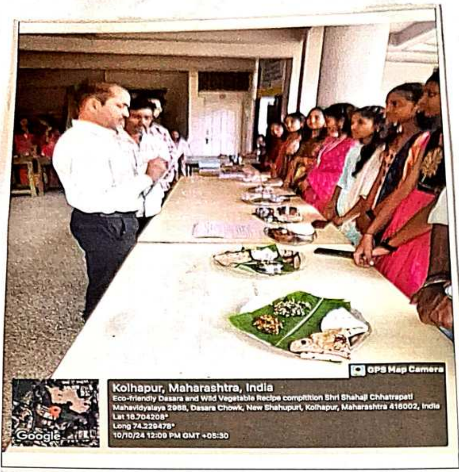
Examination of wild vegetable Dishes.