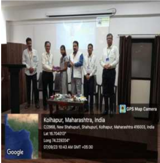
Prize distribution of LIC Quiz