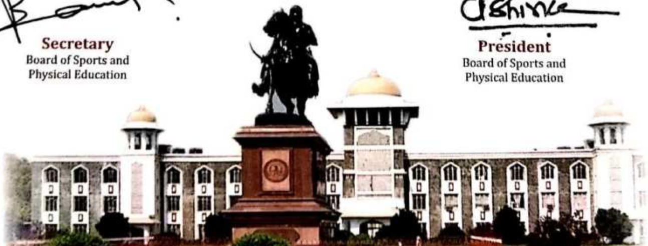
President Board of Sports and Physical Education