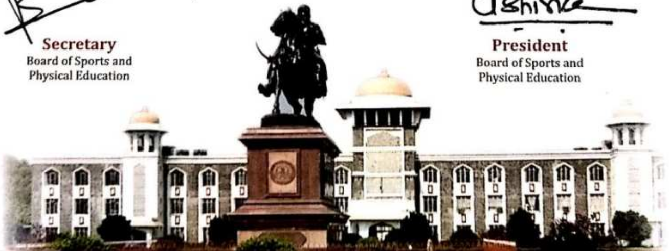
President Board of Sports and Physical Education