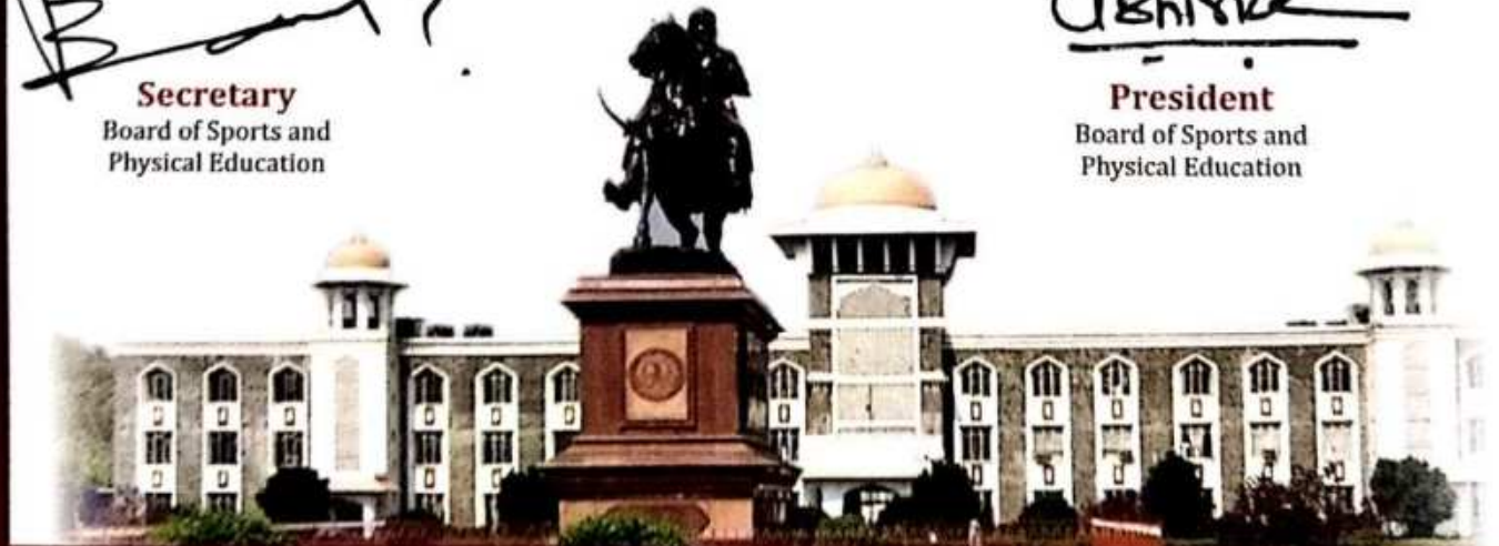
President Board of Sports and Physical Education