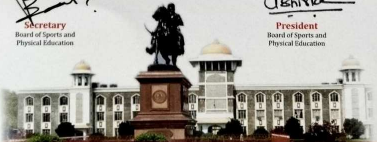
President Board of Sports and Physical Education