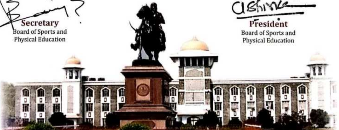
President Board of Sports and Physical Education