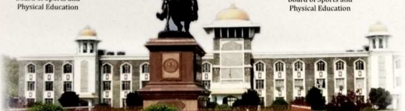
President Board of Sports and Physical Education