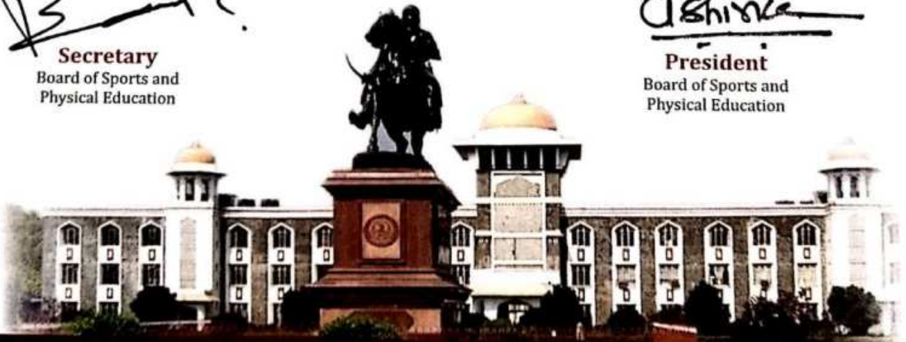
President Board of Sports and Physical Education