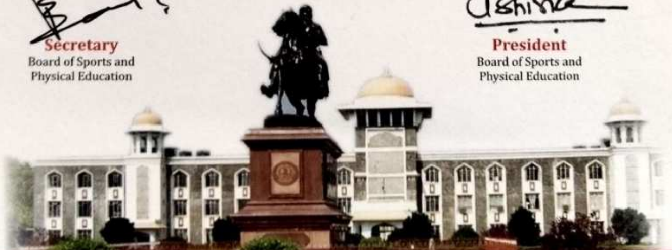
President Board of Sports and Physical Education