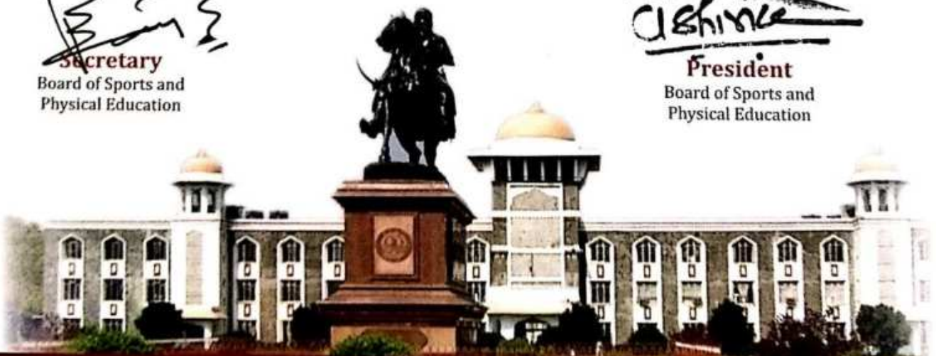
President Board of Sports and Physical Education