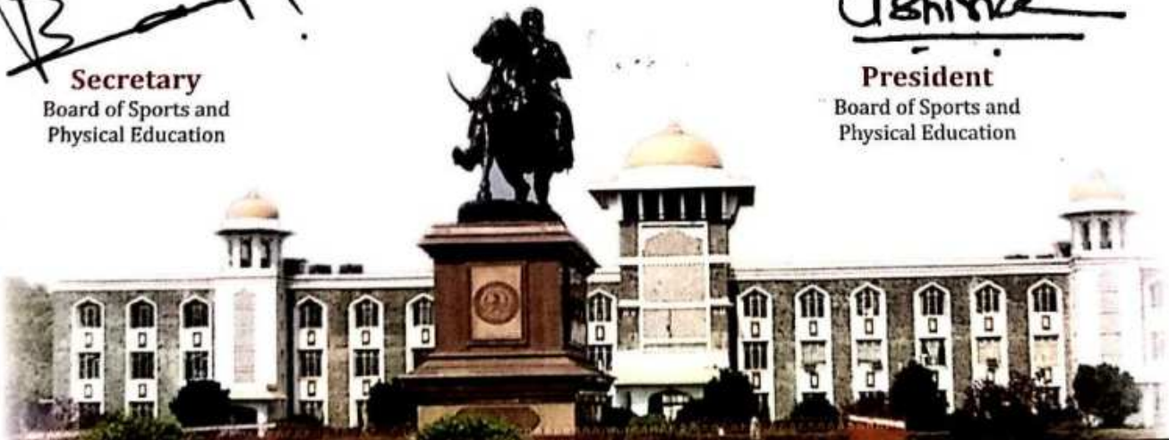
President Board of Sports and Physical Education