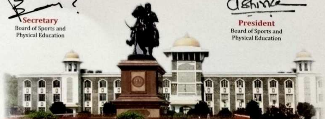
President Board of Sports and Physical Education