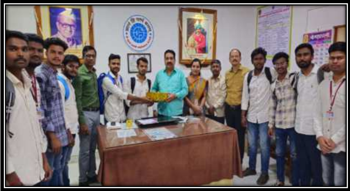
The alumni of B.C.A. department donated a projector amounting Rs. 60000/- .