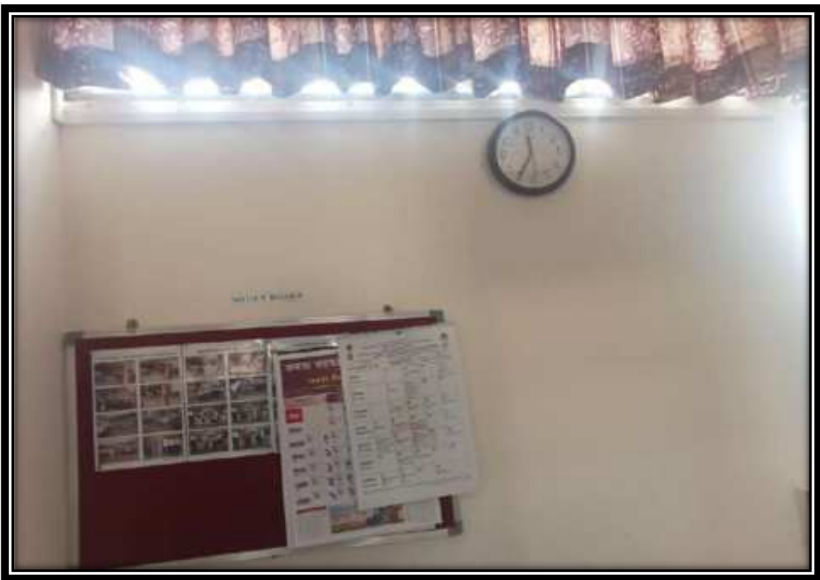
The alumni of department of Sociology has donated wall clock amounting of rupees 400/-.