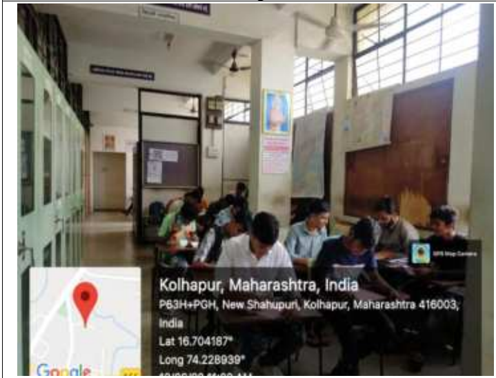
Study Room (Boys)