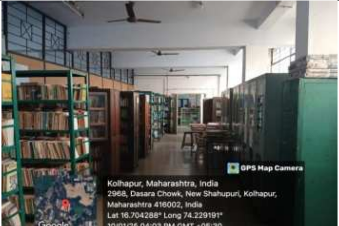
Book Accession Section