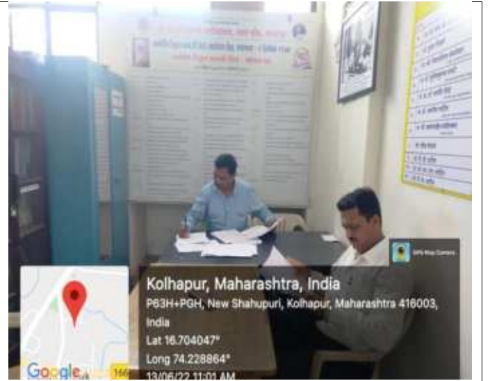
V. R. Shinde Research Center