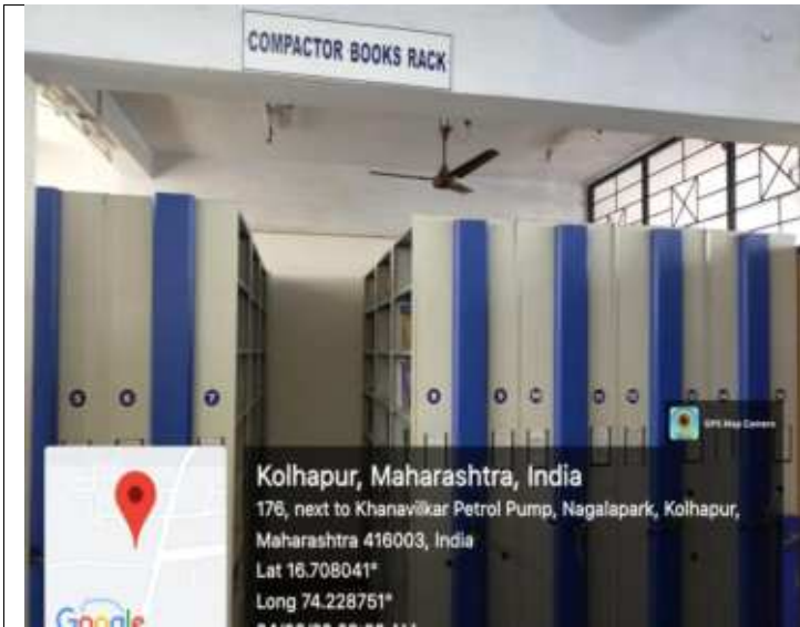
Compactor Books Rack