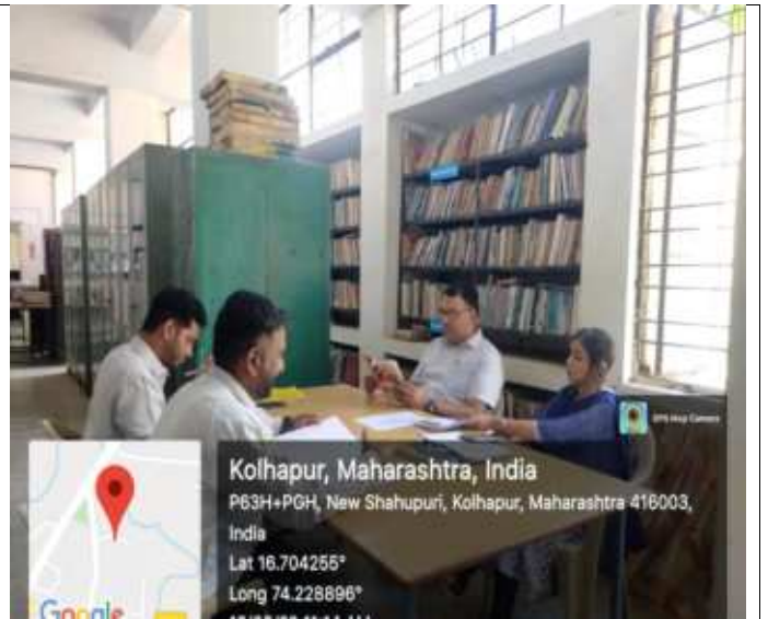
Faculty Study Section