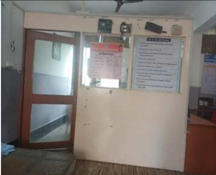
Department of BCA