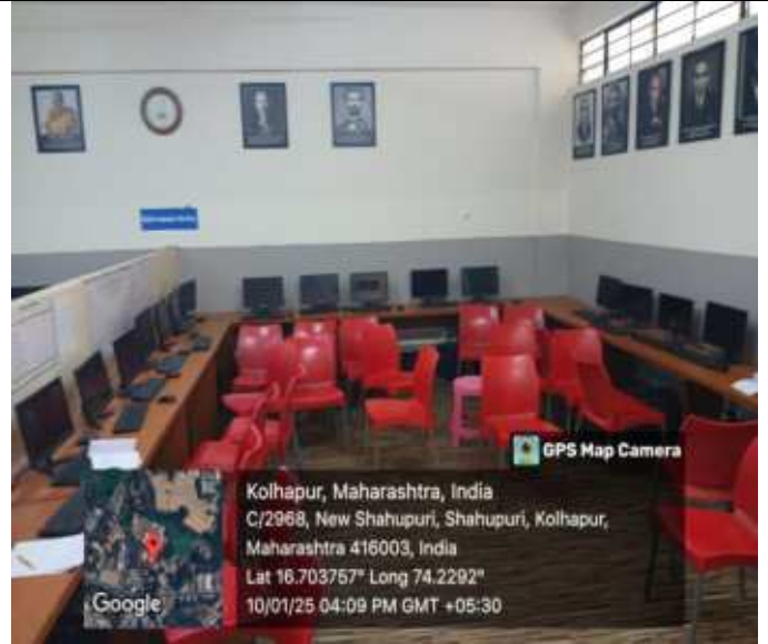
BCA Lab -1