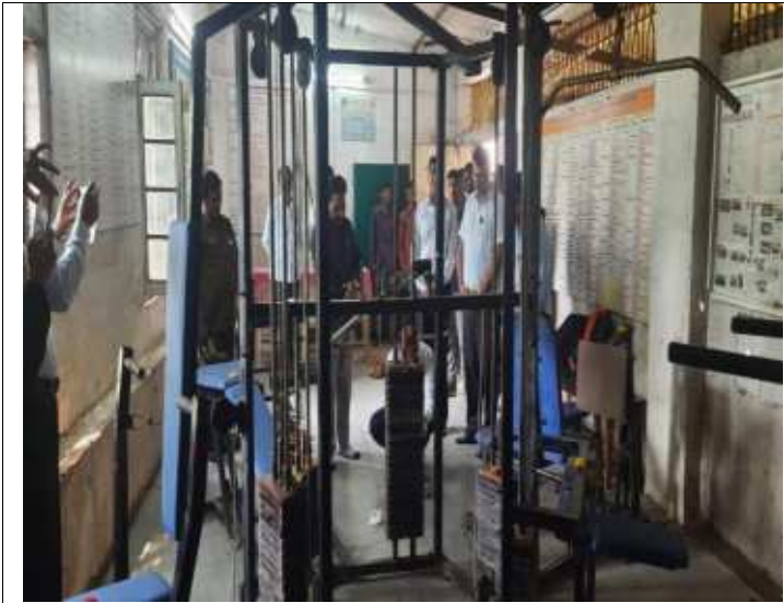
Sport Room (Gymkhana)