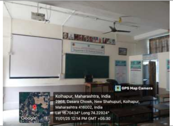
Seminar Hall II & Department of History