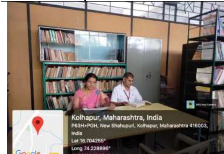
Faculty Study Section