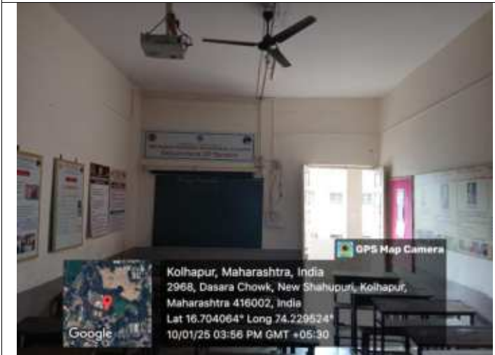
Department of Marathi