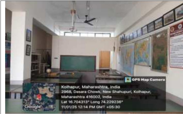
Department of Geography