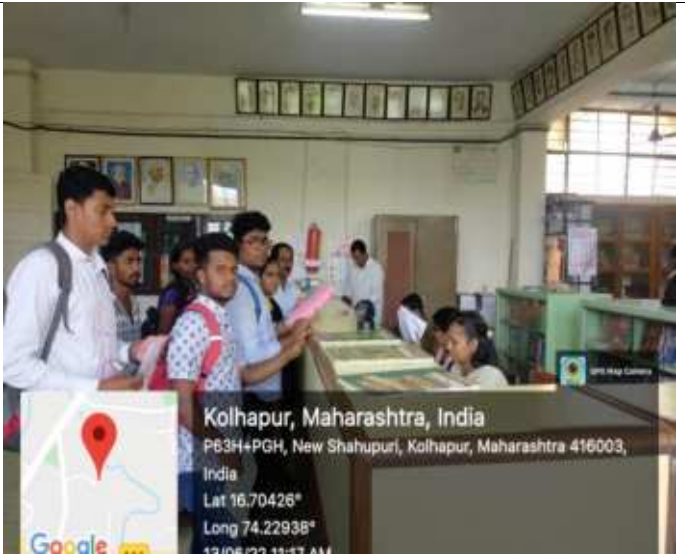
Book Issue- Return Section