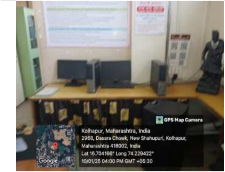
Students Computer Section