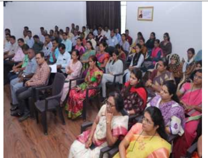
V. R. Shinde Mini Auditorium