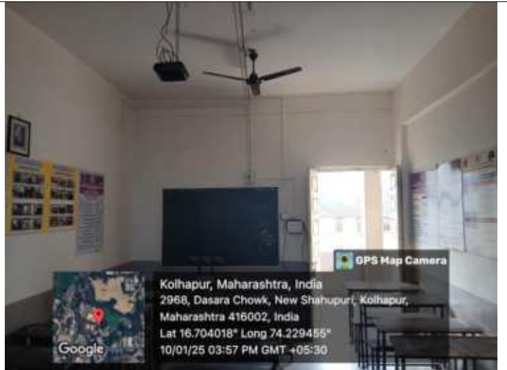
Department of Sociology