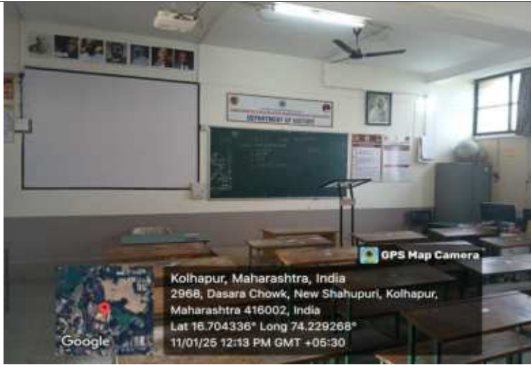
Seminar Hall I & Department of Political Science