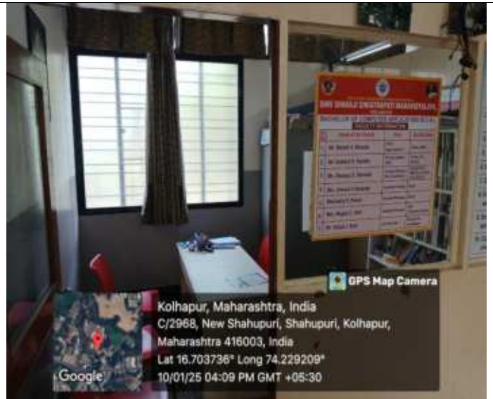
Department of BCA