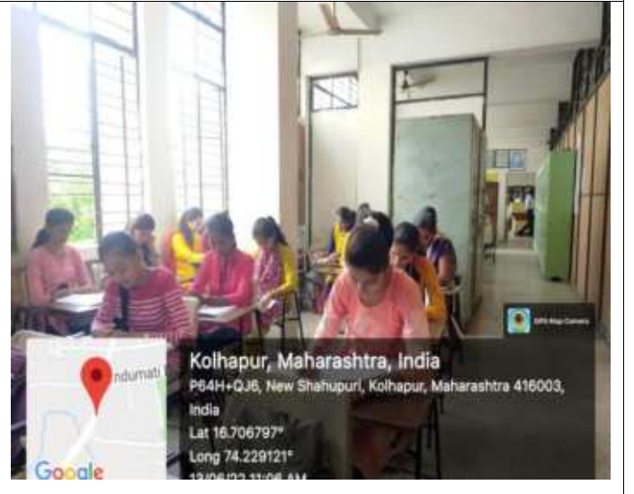
Study Room (Girls)