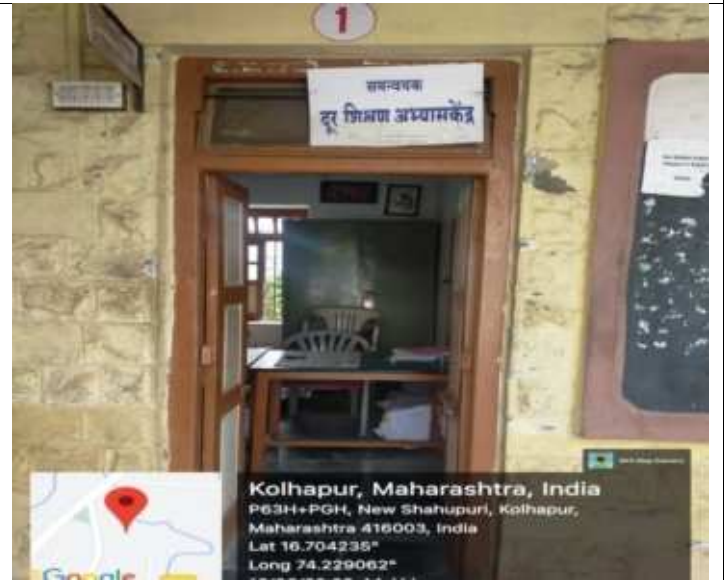
SUK Distance Study Center