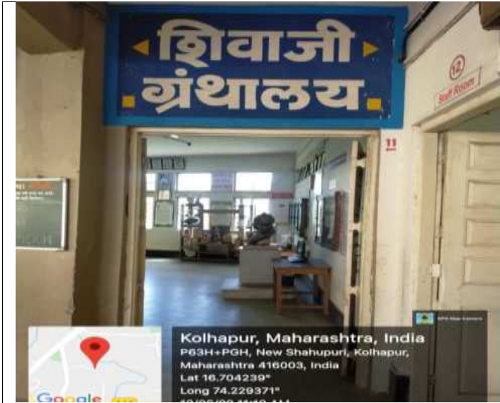
Shivaji Granthalaya (Library)