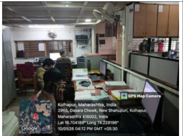
Administrative Staff Section