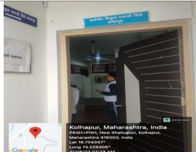
V. R. Shinde Mini Auditorium