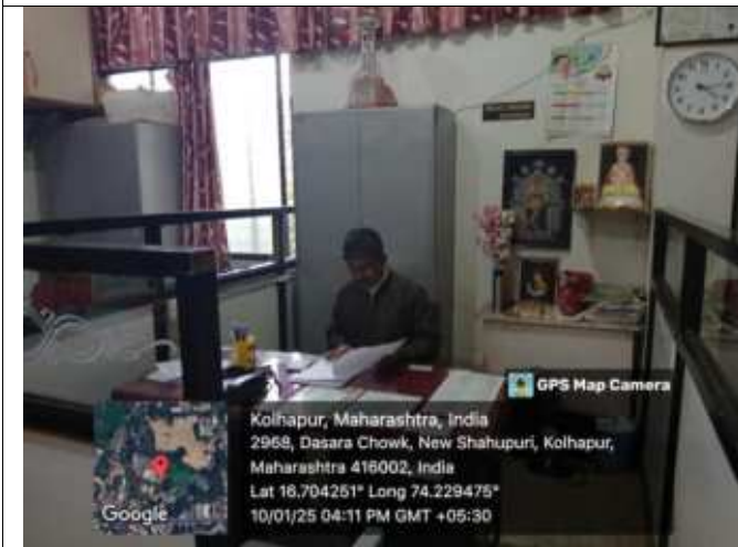
Administrative Staff Section