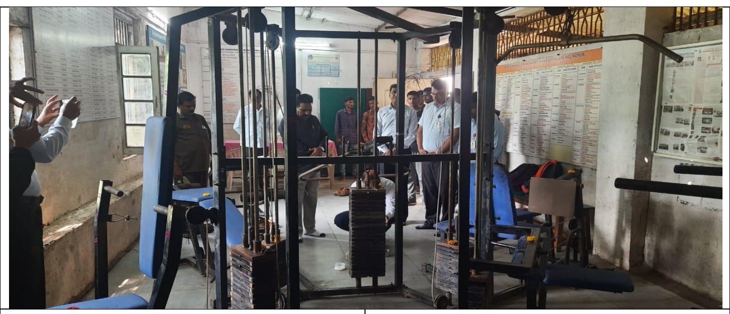
Sport Room (Gymkhana)